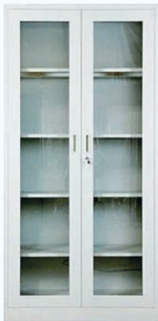
2 DOOR CABINET