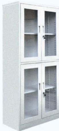
4 DOOR CABINET