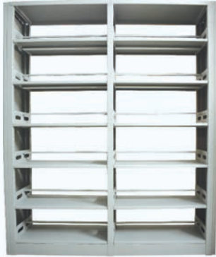
DOUBLE FACED BOOK STACK - 2 Bay