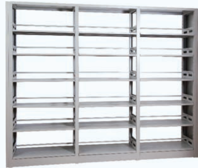
DOUBLE FACED BOOK STACK - 3 Bay