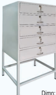
BORROWERS CARD CABINET